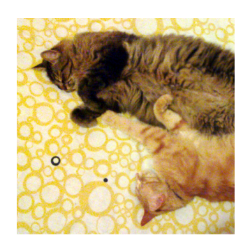
Figure 2: In this image, the cats are tessellated within a square frame. Images should also have captions and be within the boundaries of the sidebar on page 2.