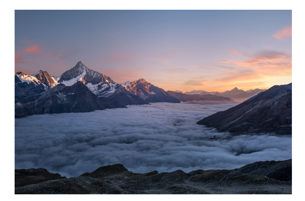
Figure 2: Weisshorn, Randa, Switzerland.