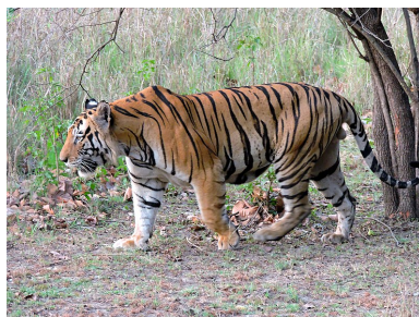
Figure 3.1: Short caption (if wanted). Full caption with all the details here.