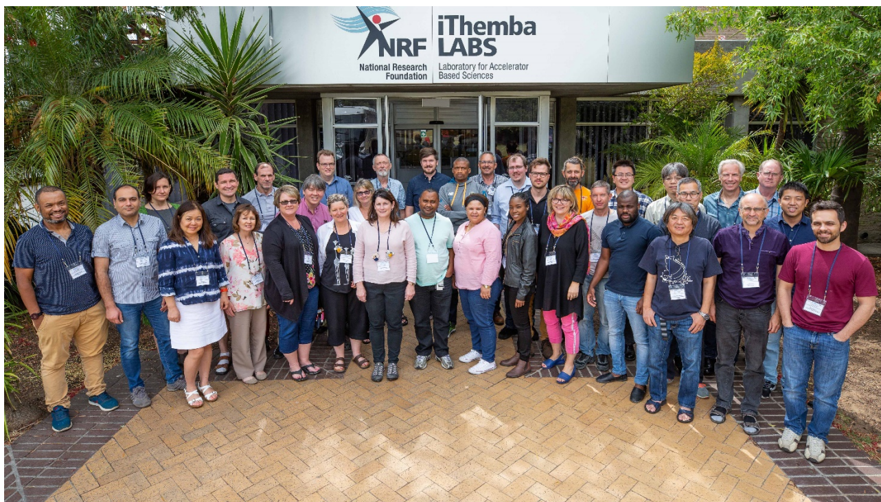
Figure 2: Example of a full-width figure showing the JACoW Team at their annual meeting in December 2018. This figure has a multi-line caption that has to be justified rather than centred.

The names of authors, their organizations/affiliations and postal addresses should be grouped by affiliation and listed in 12 pt upper- and lowercase letters. The name of the submitting or primary author should be first, followed by the coauthors, alphabetically by affiliation. Where authors have multiple affiliations, the secondary affiliation may be indicated with a superscript, as shown in the author listing of this paper. See ANNEX A for further examples.