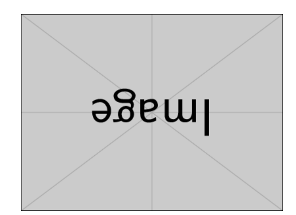
Figure 1. Always give a caption.