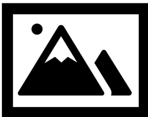
Figure 1: This is an example figure.

36 Figures should be called out within the text and numbered in the order of their citation in the text. 37 Every figure must have a descriptive title beginning with “Figure [Number] ...” All figure titles should be either a phrase or a sentence; do not mix the two styles. See Figure 1 for example.