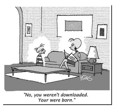
Figura 1. A typical figure